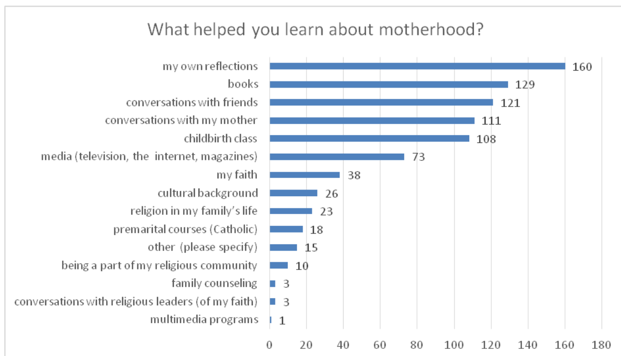
Graph 2. Responses to the question: "What helped you learn about motherhood" (multiple-choice question) n=199