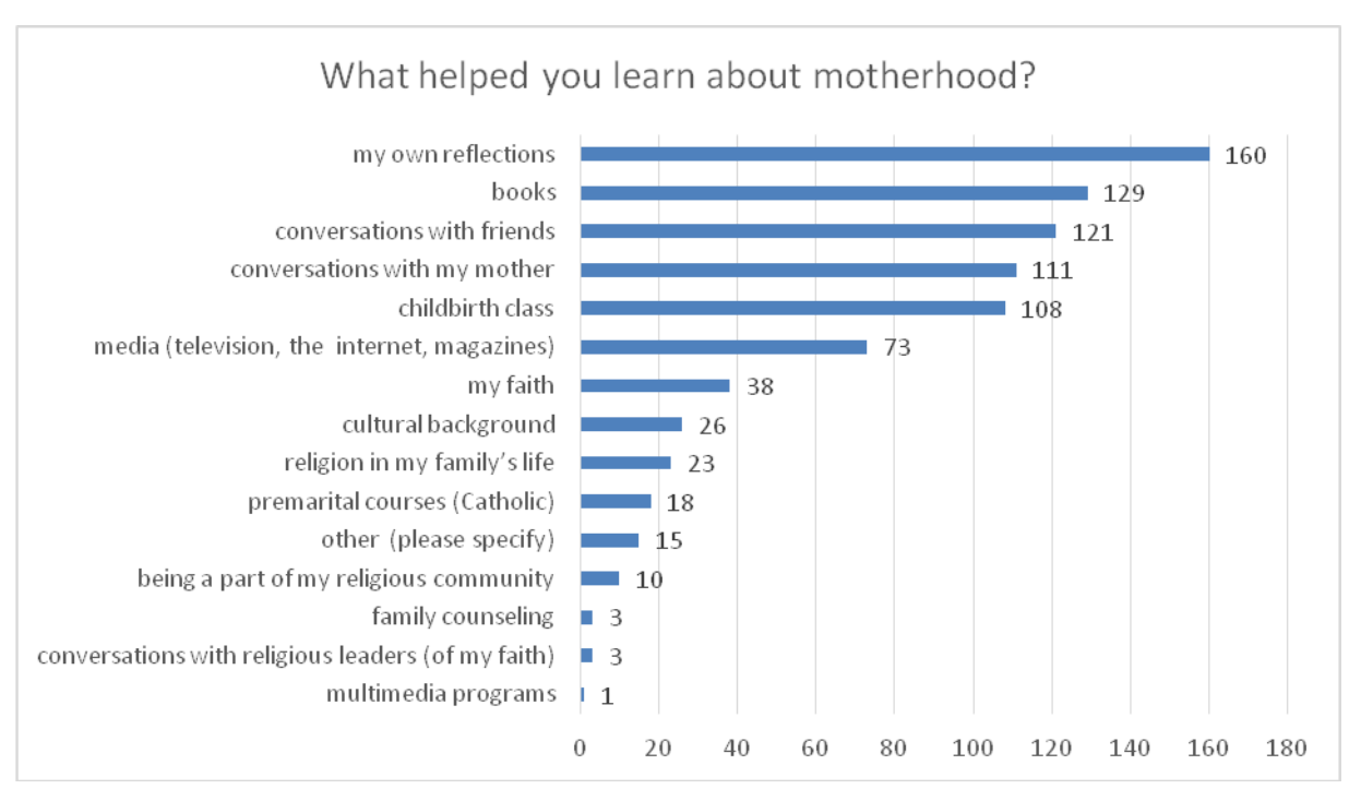
Graph 2. Responses to the question: "What helped you learn about motherhood" (multiple-choice question) n=199